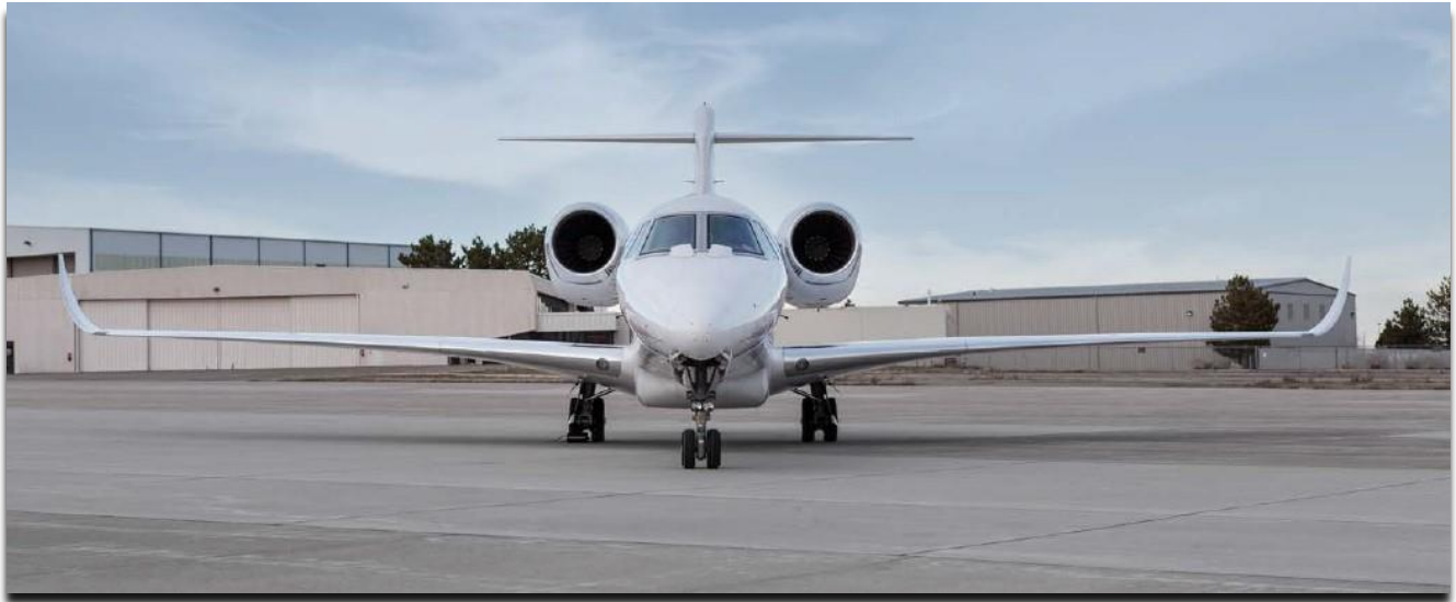
Paint: Matterhorn White with Midnight Blue and Sunfast Red Strips